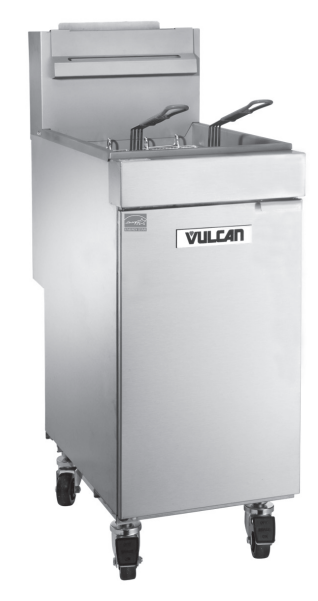
Model 1VEG35M Shown with caster accessories